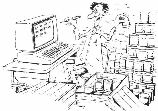
They were right! Computers do make it much easier to take inventory